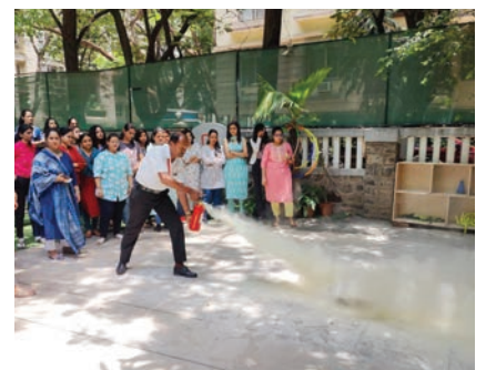
Dousing the Fire