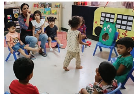
Feeding the Monster