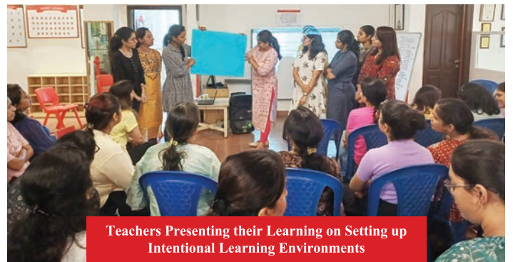
Teachers Presenting their Learning on Setting up Intentional Learning Environments