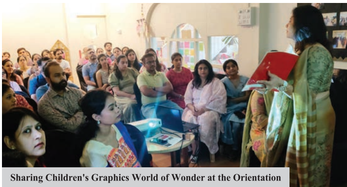
Sharing Children's Graphics World of Wonder at the Orientation