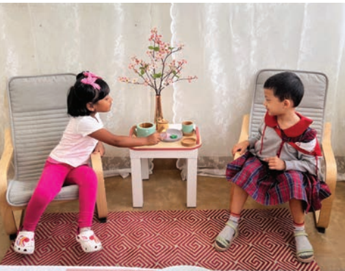
Bonding Over Food

By instilling these practices early on, children can develop confidence, respect for others, and a sense of discipline that will benefit them throughout their lives.