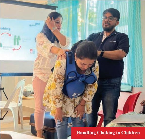
Handling Choking in Children