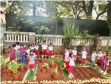
The Herb Garden