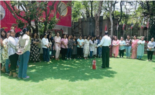
Keep Calm and Communicate Clearly