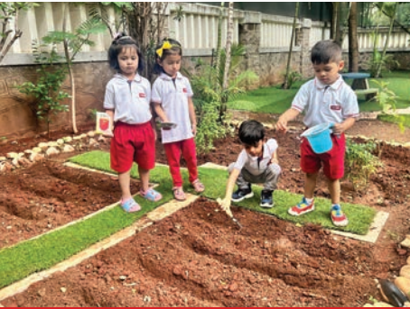
Getting the Garden Patch Ready

Our children at Vivero Kalyani Nagar and Vivero Kharadi, have added a Kitchen patch and a Herb Garden. They created a kitchen garden, learning the farming process hands-on. They sowed seeds in groups, using farming tools to plough the field and plant vegetables like tomatoes, lady fingers, beans, and coriander. Each child enjoyed watering the seeds, watching their garden grow. They also visited the herb garden, discovering different kinds of herbs like lemongrass, mint, Holy Basil - ‘Tulsi’, aloe vera, carom seed, and the hibiscus. This experience taught them about the benefits and uses of various herbs. This project was both educational and fun, instilling a sense of responsibility and a love for nature in our children.