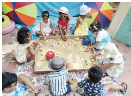
Children Exploring the Beach Set Up

By easing the transition, this well thought of meaningful program ensured that children start the new year with a positive attitude and readiness to learn, which can have long-term benefits for their academic journey.