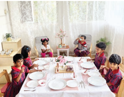
Learning Dining Etiquettes