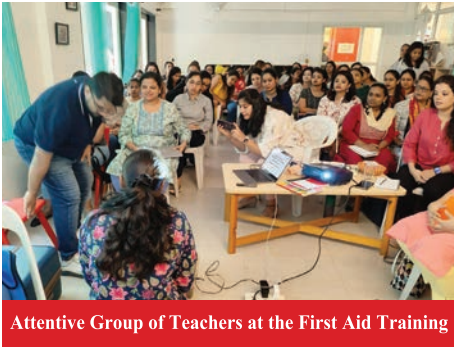
Attentive Group of Teachers at the First Aid Training