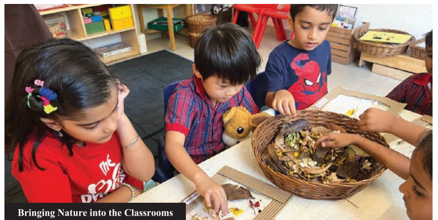
Bringing Nature into the Classrooms

It was a time filled with creativity, active fun, and joyous moments for everyone involved.