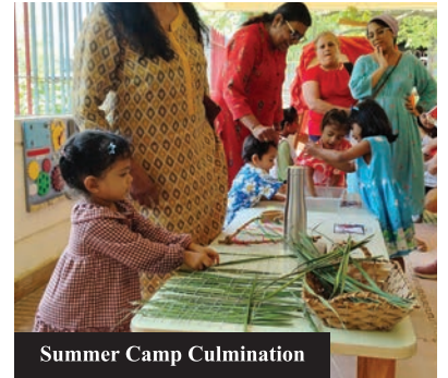
Summer Camp Culmination