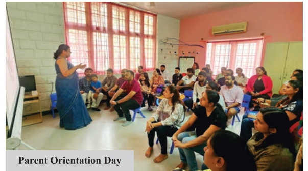
Parent Orientation Day

We are grateful for the enthusiastic participation of our parents and look forward to a successful and harmonious year ahead.