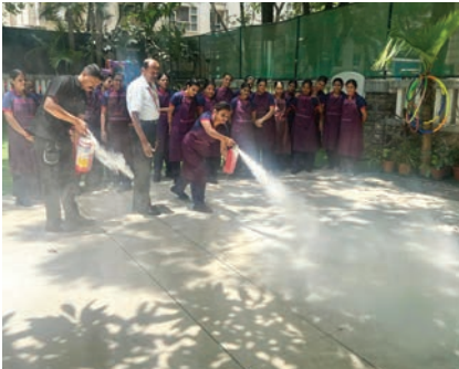
Fire Drill with the Support Staff