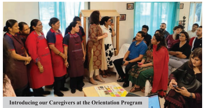
Introducing our Caregivers at the Orientation Program