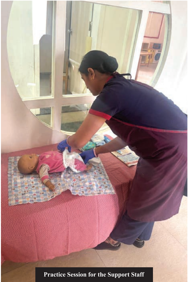
Practice Session for the Support Staff