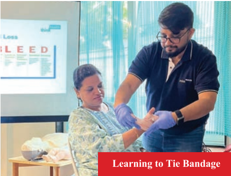
Learning to Tie Bandage