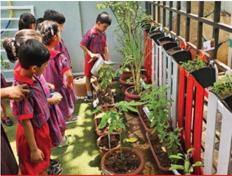
Nourishing the Plants