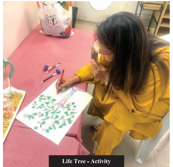
Life Tree - Activity

In our continuous effort to provide the highest quality of education and care, we recently held a comprehensive training session for the Heads of our preschools. This session aimed to further develop the skills and knowledge of our leaders, ensuring they remain at the forefront of spearheading the centers.