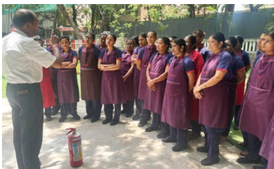
Discussing Types of Fire

The training emphasized the importance of clear communication, calm demeanour, and practicing evacuation procedures to ensure a smooth and efficient evacuation process.