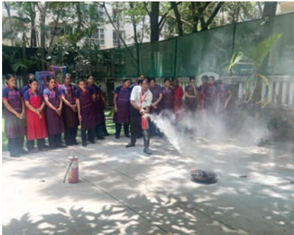
Effective Operation of the Fire Extinguisher

The First Aid training session provided our team with both basic information and hands-on practice to manage various emergencies that may arise within the school premises. The importance of having staff members who are trained in first aid cannot be overstated, as it significantly enhances the safety and well-being of our students and staff.