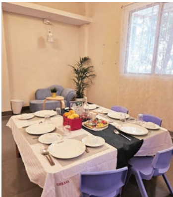
Setting the Table