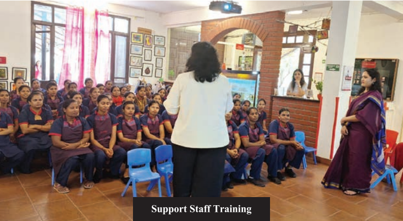
Support Staff Training