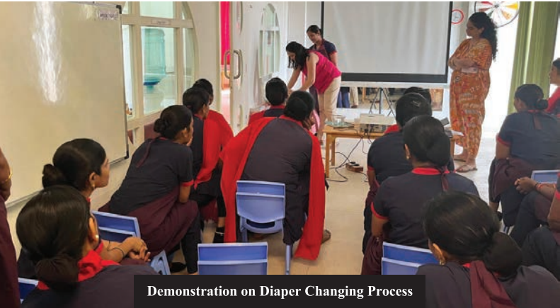
Demonstration on Diaper Changing Process

We believe that informative and hands on trainings like these would enhance the quality of care we provide to children under our care.