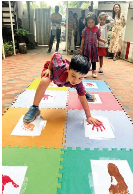
Hopsotching - Arrival Activity