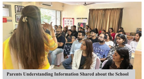
Parents Understanding Information Shared about the School