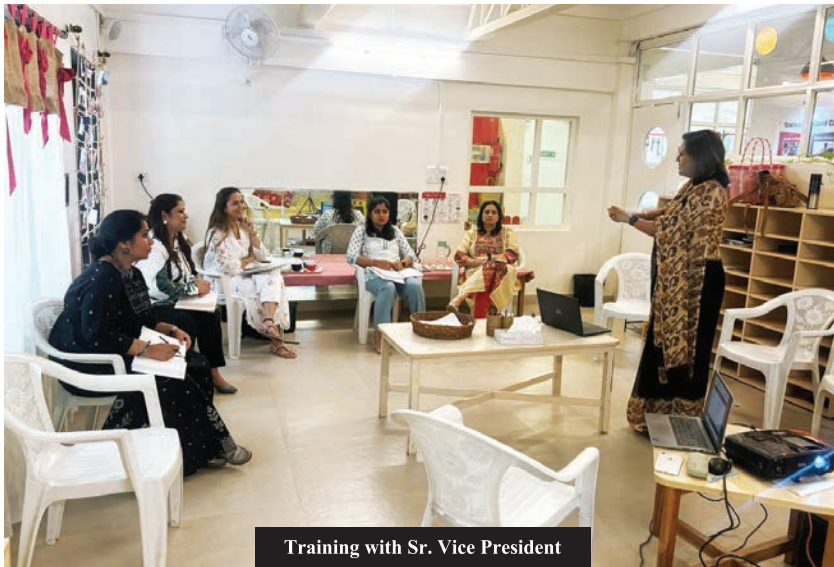
Training with Sr. Vice President