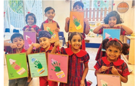
Hurrah! It's the 1st Day