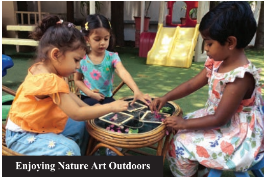
Enjoying Nature Art Outdoors